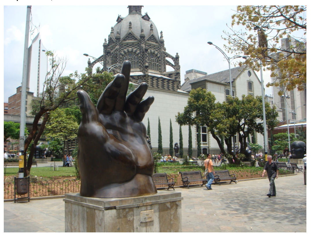
Parque Botero, Medellín

square, known as Parque Botero. Additional sculptures, and paintings of Botero's figures (similarly characterised by their exaggerated proportions) are on display at the Botero Museum nearby.