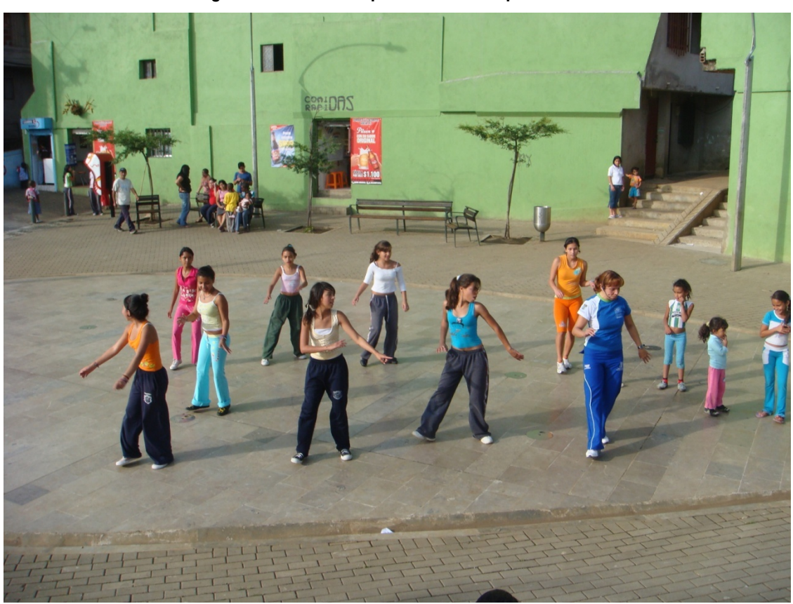
Salsa dancing class outside Parque Biblioteca España