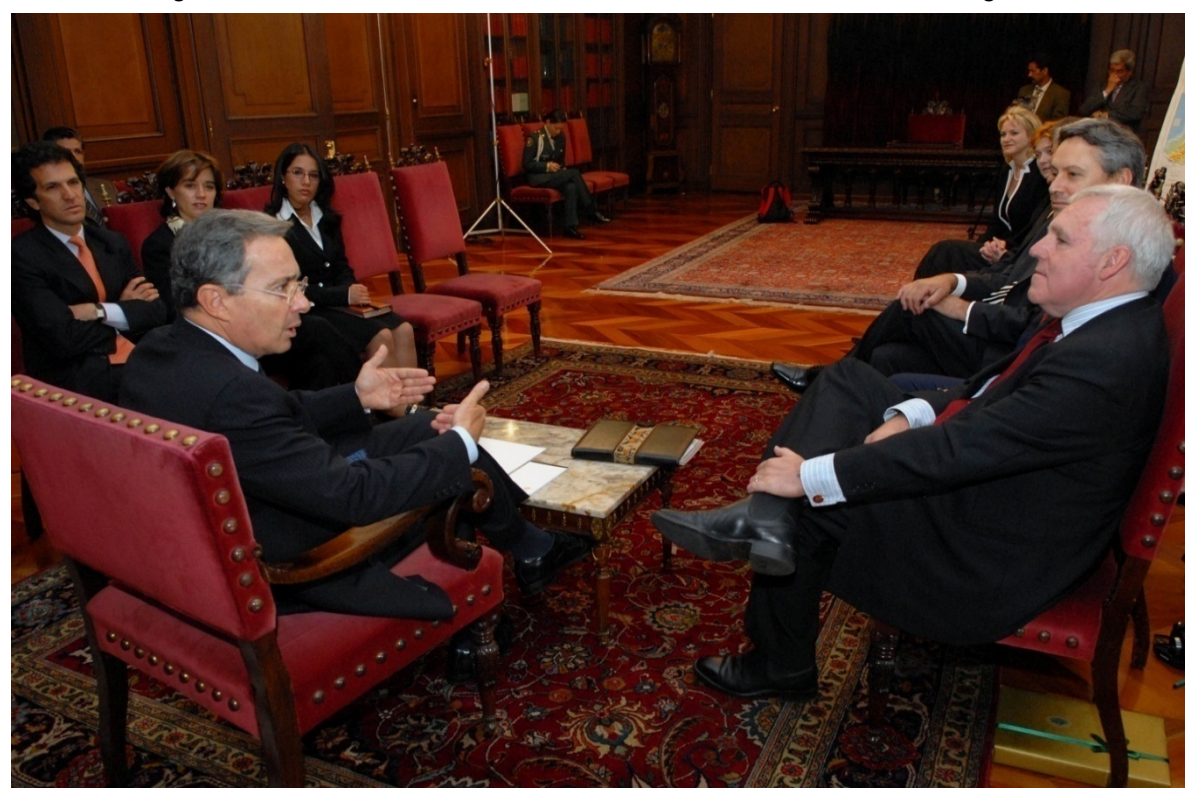
Delegation in talks with the President of Colombia and the Colombian Foreign Minister